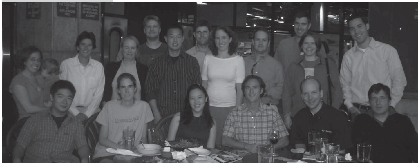
Palo Alto Pub Night at Cafe Barrone in Menlo Park, July 2007.

January's pub night returns to the British Bankers Club, a.k.a the BBC. Come join us for a drink, a bite to eat, and friendly banter. Friends and family welcome. If you have trouble finding our group, look for at least one person wearing a screamingly bright orange t-shirt. :)