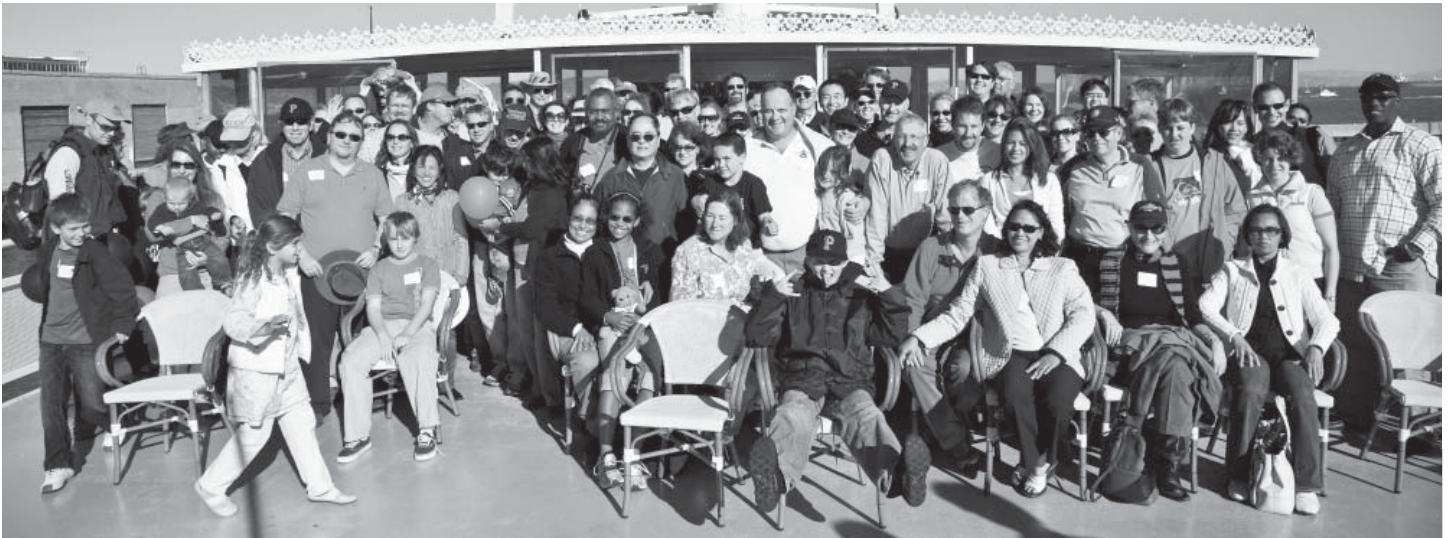
PCNC Fleet Week Cruise, October 2007.