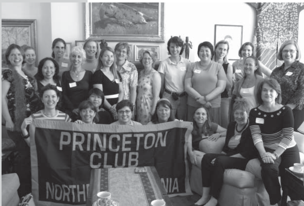
PWN Annual Tea, Palo Alto, August 2007.