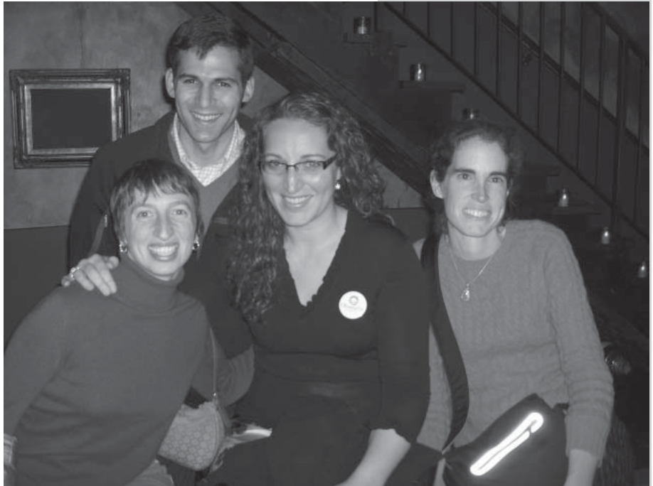
'97ers at Aspire Kickoff Event, January 2008.

Please be warned ahead of time: as this tour starts before the Museum opens, you will need to arrive at the Museum at 9:15. Once the group enters the Museum, you will not be able to enter until the Museum opens at 10:00 am for the general public. The early start time is worth it: during the first half of the tour, we will most likely have the exhibition to ourselves, with the exclusive attention of one of the Museum's highly knowledgeable docents.