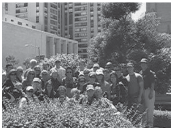
SF Discovery Walk on Nob Hill and Russian Hill (August 2007).

As someone who became involved with the Princeton Club of Northern California shortly after graduation from the University, I have enjoyed watching PCNC grow and change over the past ten years. The Northern California region is very lucky to have a large and, more importantly, active alumni/ae base. This distinguishing characteristic of our local community has been demonstrated to me once again in the efforts of our PCNC Executive Committee pulling together the 2007 Annual Dinner (please see details below and plan to attend).