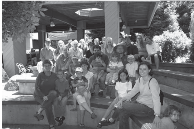
PCNC Tour at the Coyote Point Museum for Environmental Education (July 2007).

There are 45 free parking places at Pier 40, metered parking along Embarcadero, and lots between Brannan and Bryant as well as inside the hangar.